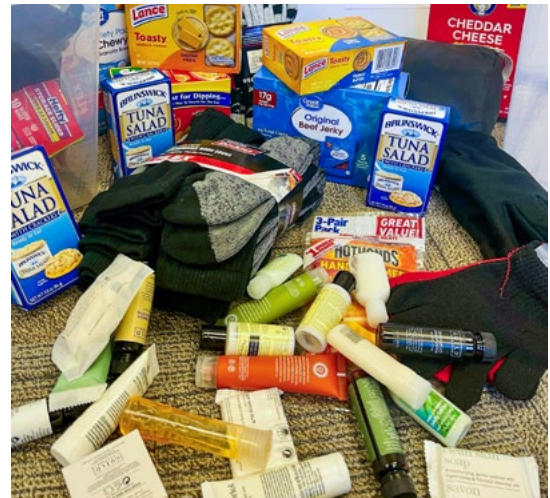
Sumner-Cowley employees have a great start on this year's donations.